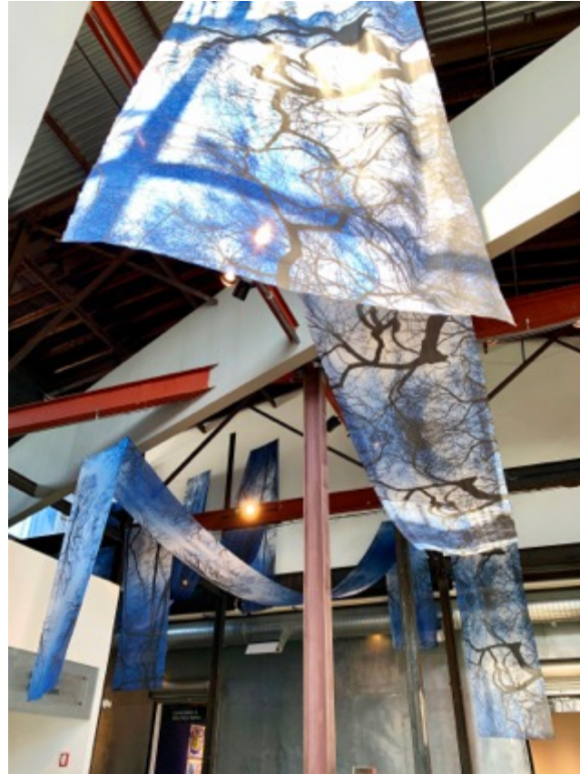
Amie Potsic Midnight Mass (Installation view) 2020, © Amie Potsic 2020