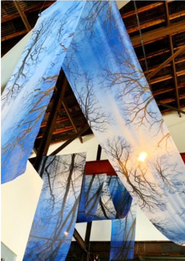
Amie Potsic Midnight Mass (Installation view) 2020, © Amie Potsic 2020