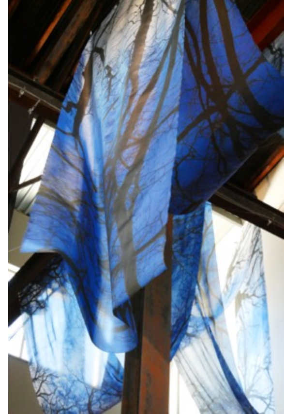
Amie Potsic Midnight Mass (Installation view) 2020, © Amie Potsic 2020