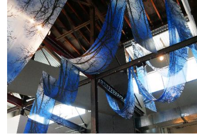
1. Amie Potsic "Midnight Mass (installation detail #2)" Archival pigment print on 250 linear feet of silk 2020 © Amie Potsic 2020